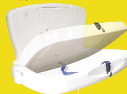
Horizontal changing table