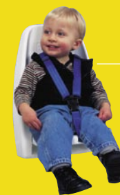
Wall mounted infant safety seat also available